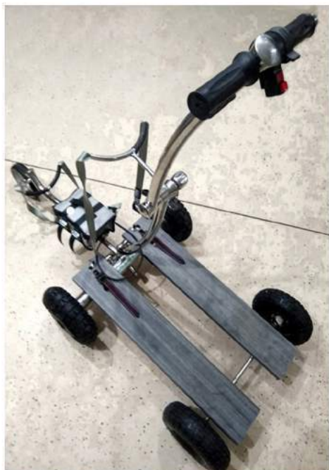
Golf Walk and Ride Trolley Assembled