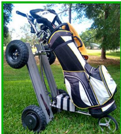
Walk and Ride Trolley Walk - Platform Up