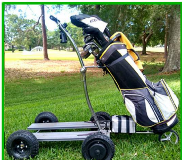
Walk and Ride Trolley Ride - Platform Down